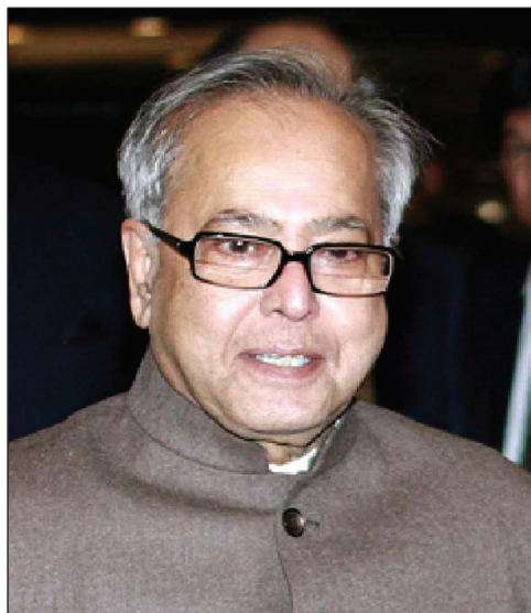
Shri Pranab Mukherjee

Honourable President of India and Visitor, IIT Bhubaneswar